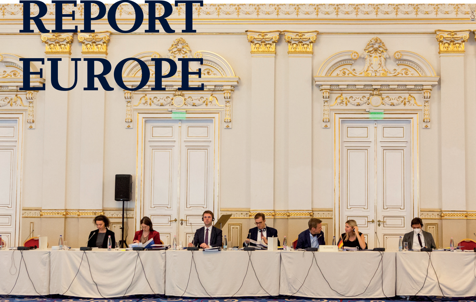
Delegation of the Bundesnotarkammer