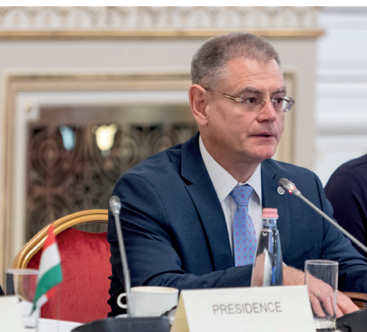
President of the CNUE Ádám Tóth

On the eve of the General Assembly, a task force met to agree on CNUE's contribution to the “Conference on the Future of Europe”. This major EU project aims to bring European institutions and values closer to citizens. It includes a digital platform where citizens can directly exchange ideas, the European