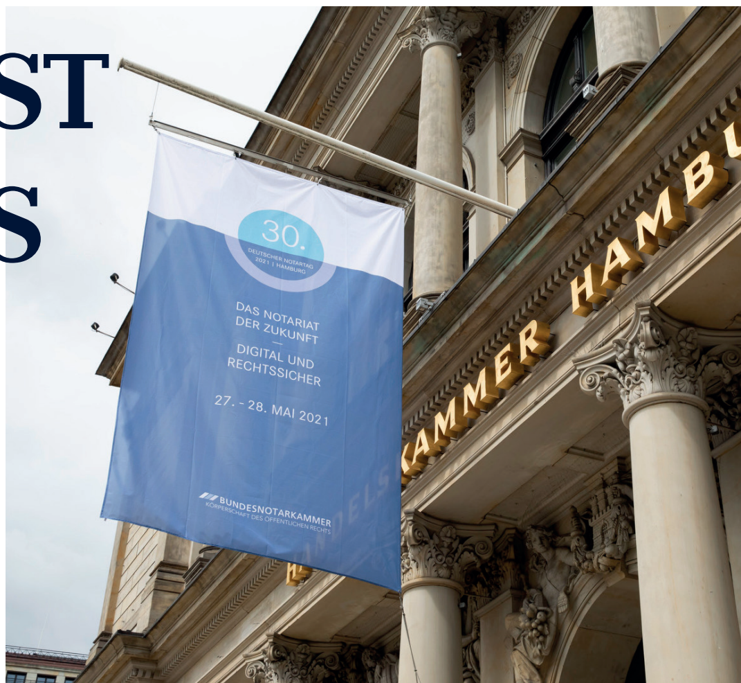
30 th Congress of German Civil Notaries